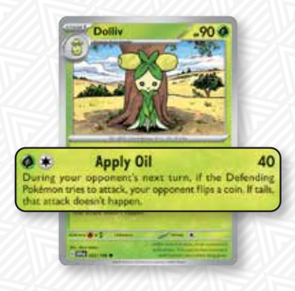
Dolliv's Apply Oil attack affects Call for Family, but not Busybody Nurse.

For example, Squawkabilly's Call for Family attack does no damage, but it's still an attack! Anything else is called an Ability or something else. For instance, Blissey's Busybody Nurse Ability might let your Active Pokémon recover from all Special Conditions, but it doesn't count as an attack.